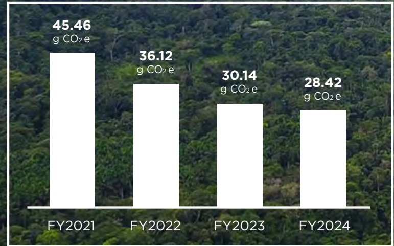
Emissions per unit purchased YoY

In FY2022 and FY2023, we saw significant reductions—largely thanks to contract manufacturing facilities adopting renewable energy at their facilities. This past year, the downward trend continued, though more modestly. This doesn't reflect a shift in focus, but rather the reality that further reductions require continued collaboration and investment with our suppliers. We remain committed to finding effective ways to lower emissions while balancing feasibility and cost.